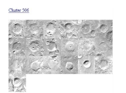
Figure 2. A cluster of similar craters. Adapted from Figure 8.18, Gibbens [2].